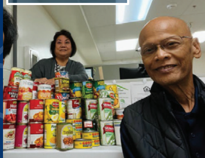
Hale Mahaolu Disaster Relief Necessities and Food Drive

The heart of Maui has always been its people. For almost 80 years, Maui United Way has been a trusted community champion, working to forge connections and build a network of trust. At the core of our mission lies an unwavering commitment to ensuring every member of our 'ohana, no matter where they come from or what their challenges may be, has access to the resources they need to thrive. Thanks to community support and a big lift from donors near and far, Maui United Way remains united to do more good.